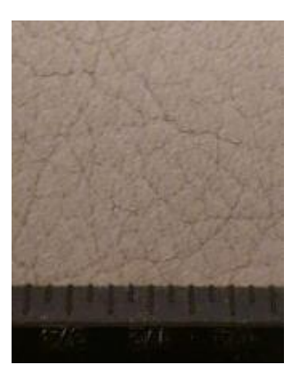
Damaged Leather Through A Microscope

To the naked eye, a great deal of damage on the leather surface cannot be seen unless you use a microscope to view this correctly. See the picture below of damage viewed via a microscope, that normally would not be seen.