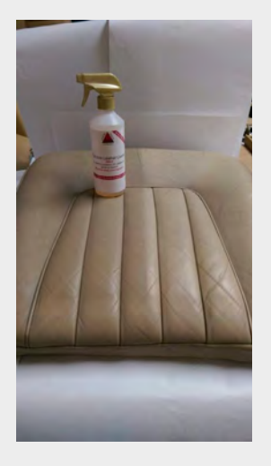
Leather cleaning half done car seat base