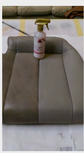
Leather cleaning Mercedes seat

You can then check the area again with a microscope if you wish.