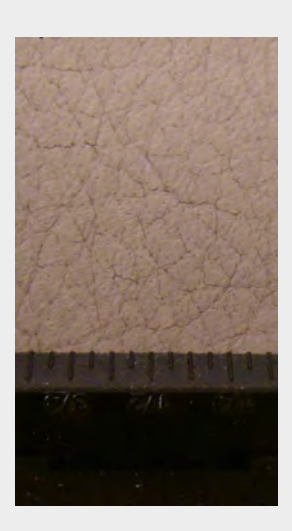
Leather cleaning damage through a microscope

These pictures show how clean leather can be cleaned using the correct products and methods of cleaning.